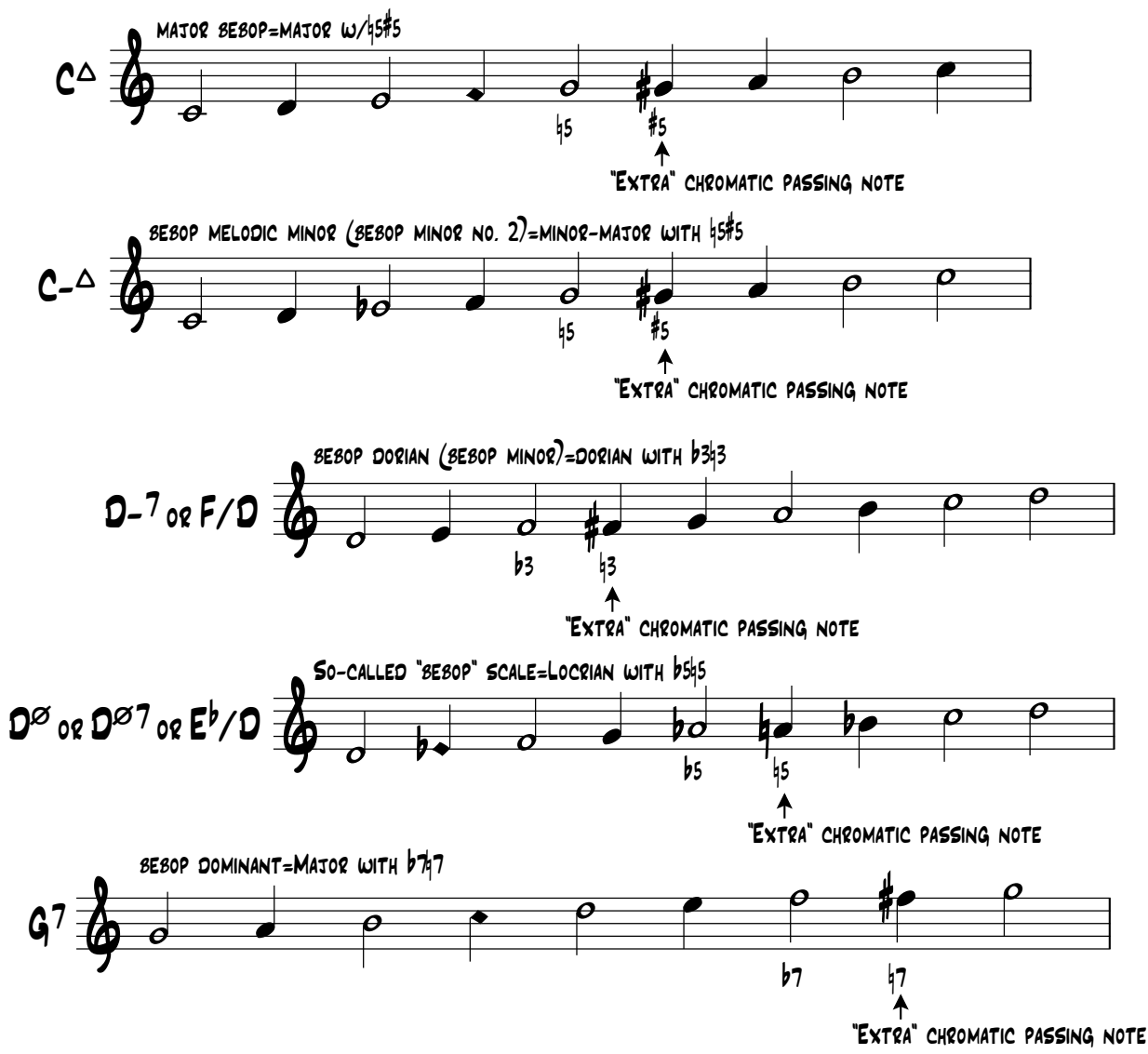
COPYRIGHT © 2010 BY MARK FEEZELL. ALL RIGHTS RESERVED.

IN PRACTICE, THE CHROMATIC PASSING NOTE MAY BE ADDED JUST ABOUT ANYWHERE. BELOW ARE SOME OF THE MOST COMMON POSSIBILITIES WITH NAMES. PRIMARY CHORD TONES ARE SHOWN AS OPEN NOTEHEADS, AND "HANDLE WITH CARE" NOTES ARE SHOWN WITH SQUARE NOTEHEADS. 4 REFERS TO THE <u>MAJOR</u> SCALE NOTE, # MEANS RAISED, ETC.